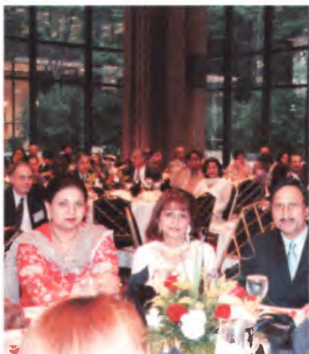
Guests at Alumni Dinner