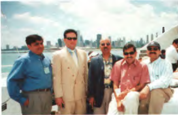
Slick and the not so slick on the Boat Cruise