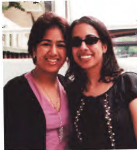
Chicago by the River