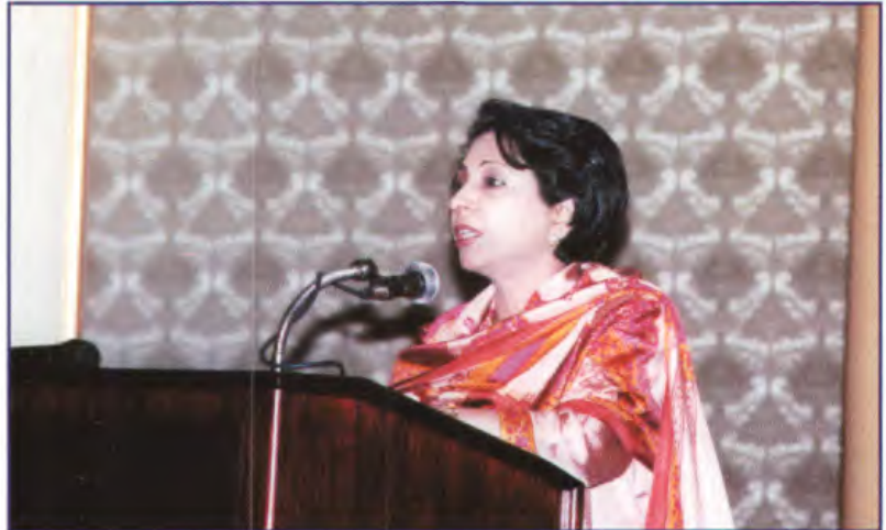
Dr. Maleeha Lodhi