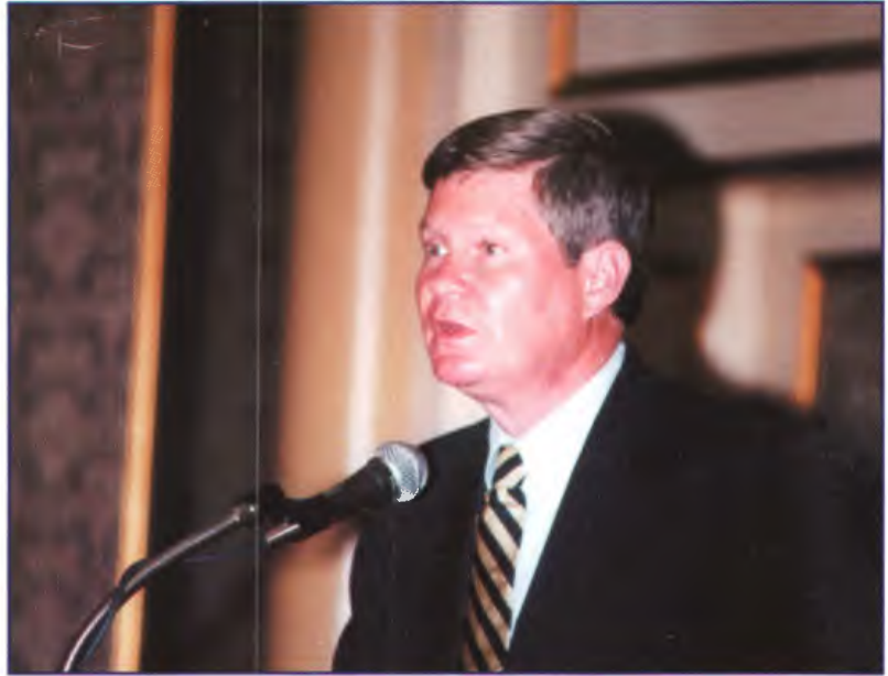
Senator Tim Johnson

The Pakistan Ambassador, Dr Lodhi thanked the participants for their kind views and stressed the need for continued commitment by the American Pakistani community to stay involved with the process of change. She quoted President of Czech republic, "Genuine politics-politics worthy of change-is simply a matter of serving the community and serving those who would come after us". She reinforced the principal to bring about change in our leaders and transform the social landscape of Pakistan for the welfare of our people.