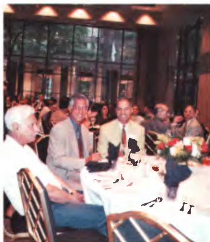
Guests at Alumni Dinner