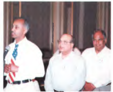
4th of July Spirit