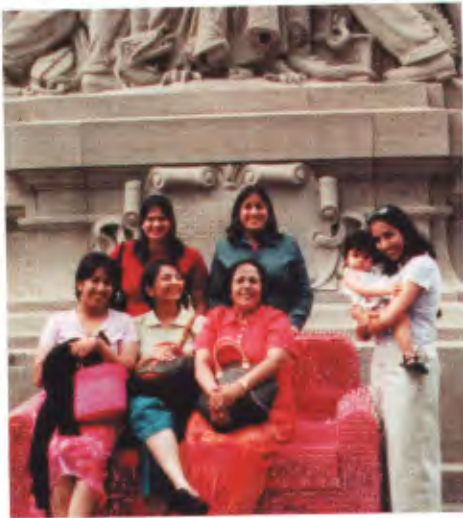
Chicago in Daytime