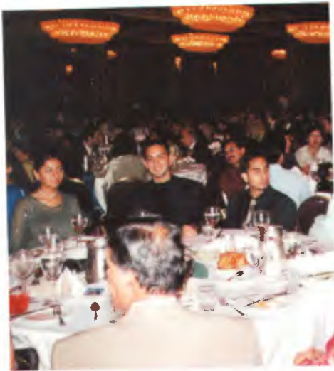
Guests at Banquet