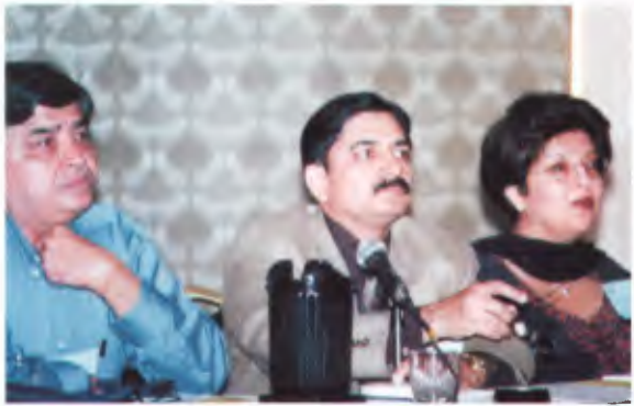
Executive Council Meeting