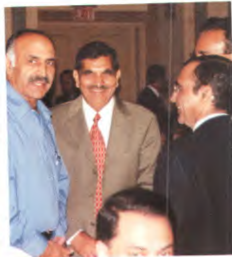
Guests at Banquet