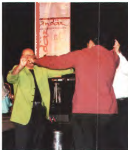
"Bhangra ta Bhangra"